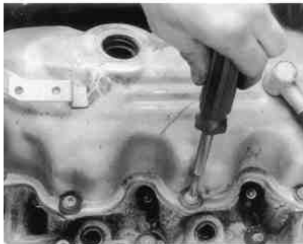
Fig. 3: Remove the gasket and clean the cylinder head